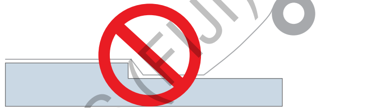
Figure 2 Tape instructions figure stretched